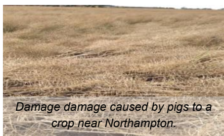
Damage to a crop near Northampton.