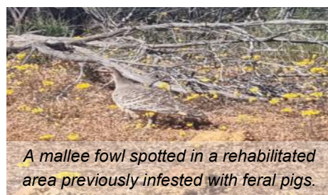
A mallee fowl spotted in a rehabilitated area previously infested with feral pigs.