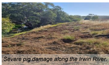
Severe pig damage along the Irwin River.

For rabbit control EOIs, or reports and photos of crop damage, please contact Chris O'Callaghan on eo@mbg.org.au or 0429446515.